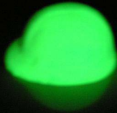
Night (No Lights)

Safety Hard Hats painted the GS GLOW Paint